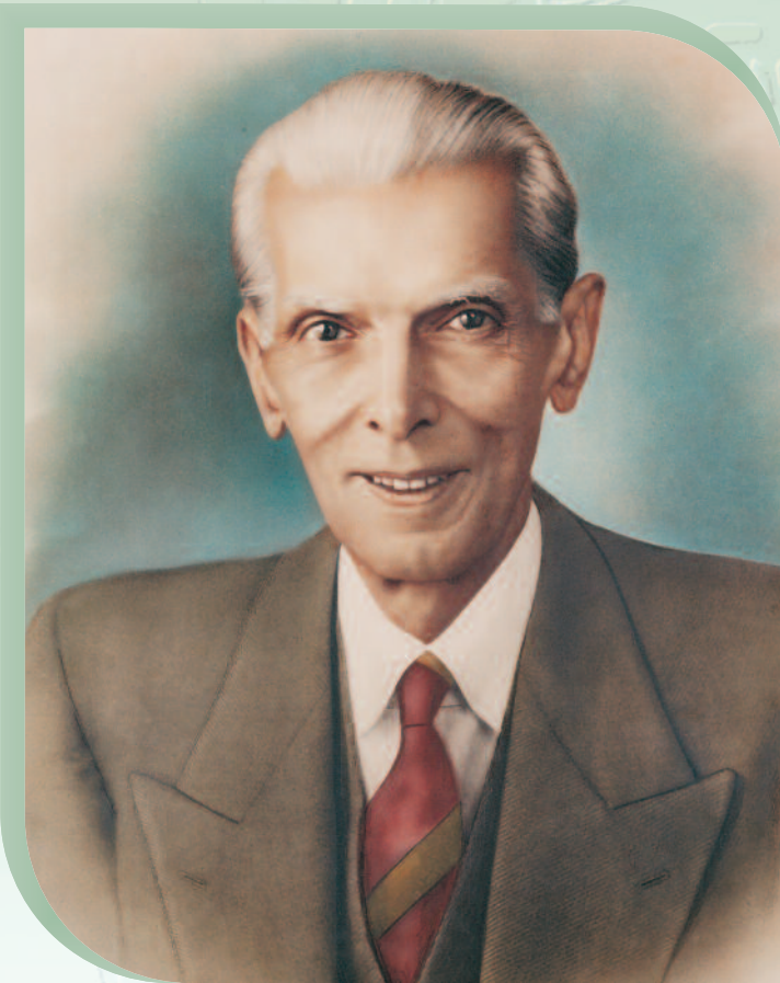
QUAID-E-AZAM MUHAMMAD ALI JINNAH

“In short, we have to build up the character of our future generations which means the highest sense of honor, integrity, selfless service to the nation, and a sense of responsibility, and we have to see that they are fully qualified or equipped to play their part in the various branches of economic life in a manner which will do honor to Pakistan.”