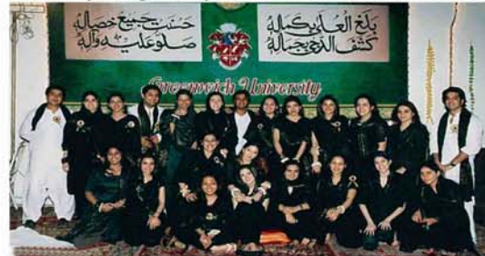
The team of students which made it possible.