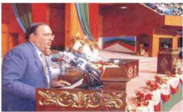
Prof. Dr. Atta-Ur-Rahman welcoming participants at the Convention