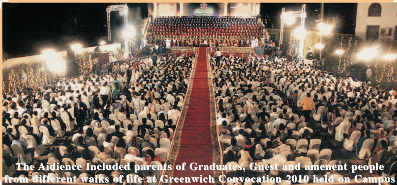
The Audience Included parents of Graduates, Guest and eminent people from different walks of life at Greenwich Convocation 2010 held on Campus

Convocation which is traditionally held once in two years.