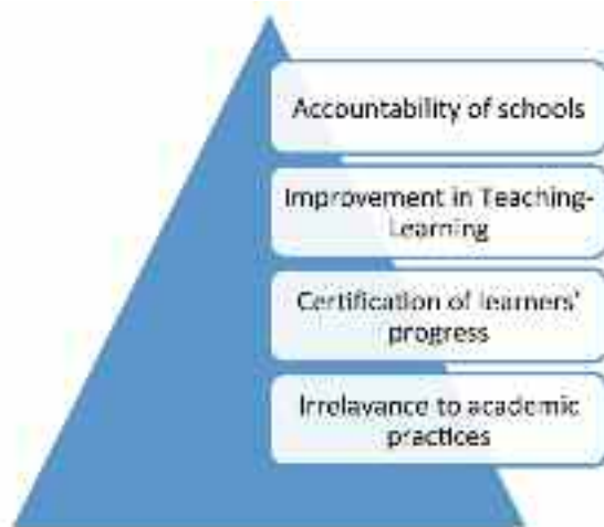
Table 1: Brown's Framework of Conceptions of Assessment

performance for entering higher educational institutions. The third one stands for judging institutions' and instructors' ability to provide quality instruction. The fourth and last conception is regarding the irrelevance of assessment to teaching. This claim is based on the assumption that both teachers as well as learners' are familiar with the context, syllabus and assessment tools; therefore, there is no need for conducting formal assessment to judge teaching-learning outcomes.