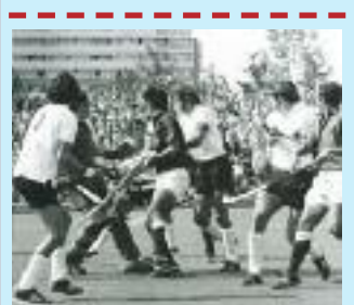
November 24, 1978 Pakistan won Hockey Championship at Lahore and defeated Australia