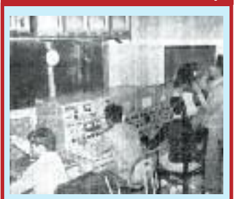
On November 26. 1964, the country's first major televised media broadcasting network was launched