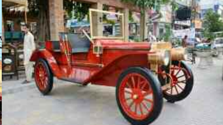
An antique car display at the Pedestrian Street in Rawalpindi's revamped Sadar market.