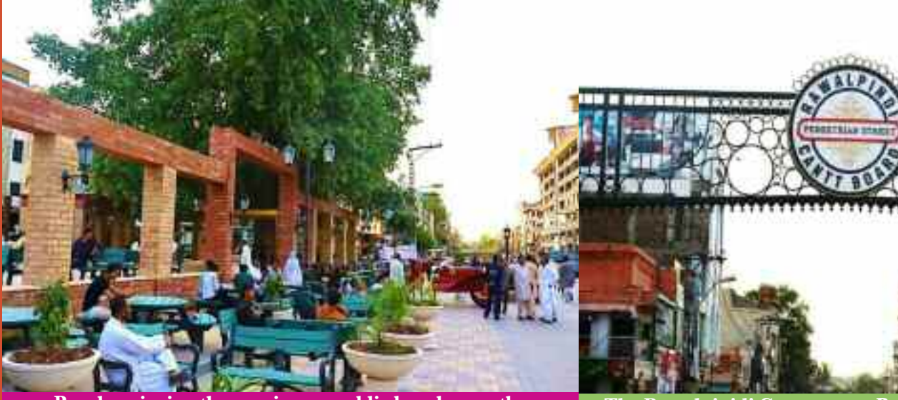
People enjoying the evening on public benches on the Pedestrian Street in the revamp Rawalpindi Sadar