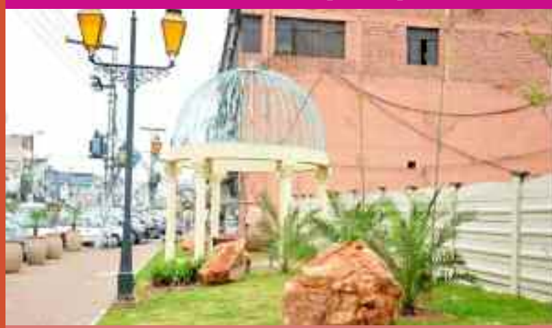
The street lights too have been revamped on the Pedestrian Street in Rawalpindi Sadar