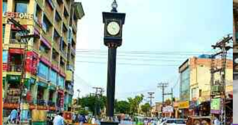
The state-of-the-art Pedestrian Street has been designed and created on the Bank Road.