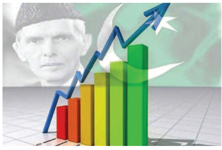
than 5% in the next decade.

Pakistan's estimated GDP growth 5.3% is also ahead of 4% GDP growth of Israel. This makes Pakistan world's fifth fastest-growing economy in the world, only behind India and China and two other countries. The live data, which is updated twice-daily, is published on The Economist website in the form of an interactive table of economic and financial indicators. This data reinforces a Harvard University study which predicted Pakistan to grow by more