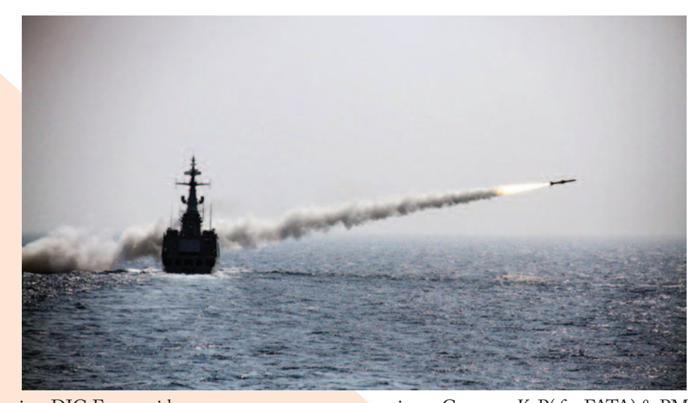
ing, DIG Forest said.

Speaking to the media he said that tree plantation campaign was the first step to control deforestation, in this mass scale campaign. Forestation was focused and ministry launched plantation campaign in public schools of Islamabad to involve and motivate young the young generation and create awareness among them regarding plantation. Second project was `Survival of Forest Resources in Pakistan,"An amount of 3.625 Rs billion has been already approved for the project in November by CDWP and now that project is in ECNEC and we are hoping that project would be approved in next meet-