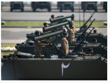
Tank crews steer their vehicles