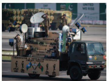
Military personnel salute as they take part in a Pakistan Day