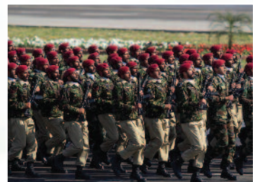
Commandos from the Special Services Group (SSG) march