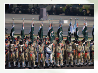
Air Force soldiers march past