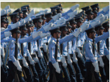
Air Force soldiers march past