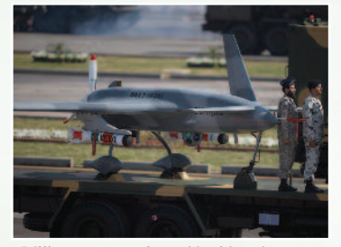
Military personnel stand beside a drone on a transporter