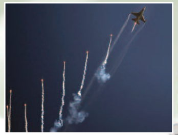
A Pakistani F-16 fighter jets flies past