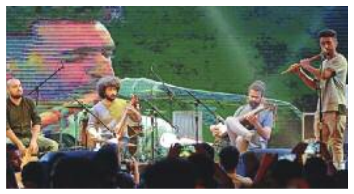
the first day of the event.

Besides digital gaming lounges, a startup expo, art installations, folk musicians and cultural performances were the main features on