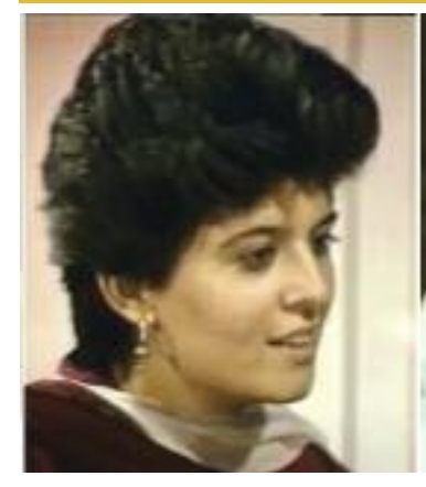
PTV reveals that Dhoop Kinare and Tanhaiyaan have been selected for airing in Saudi Arabia this year.

Saudi Arabia will be airing popular television series Dhoop Kinare (1987) this June, state reports.