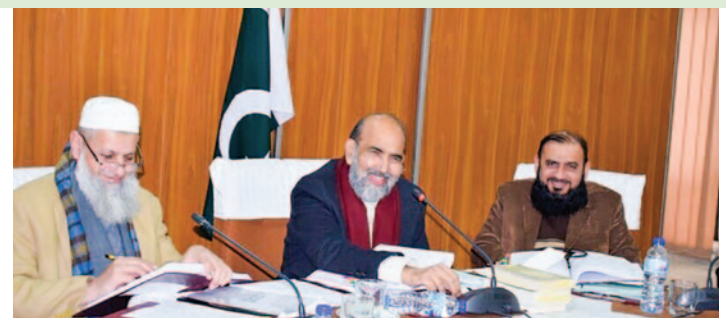
must be ensured.

The council expressed concerns over the social and legal problems faced by intersex and transgender persons, he said, adding that protection of basic human rights of these persons