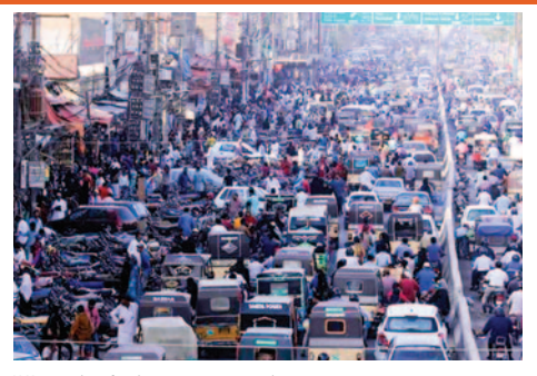
He asked the provincial census commissioners and those in AJK, GB and Islamabad to speed up the verification exercise to complete it positively on May 15.

Mr Zafar reminded the provincial and regional governments that it had been decided during the 13th meeting of the Census Monitoring Committee on May 10 that the census field operation would not be extended beyond May 15 as it was linked with the delimitation for the upcoming general election.