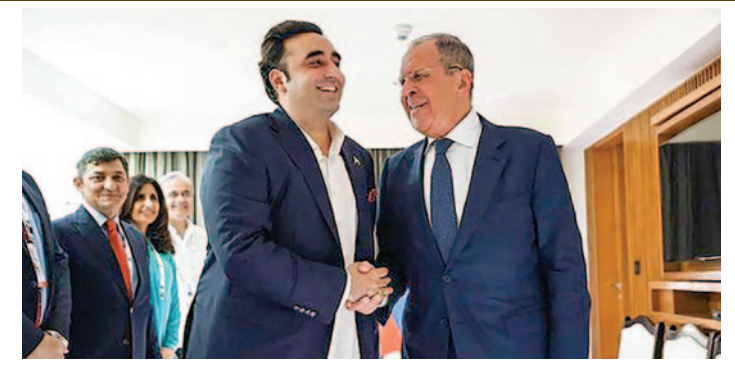
meetings with their respective counterparts from other nations.

The event will conclude with the signing of a memorandum with New Dialogue Partners. The leaders will then hold various bilateral