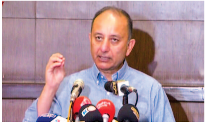
(PTI) for doing politics on the Russian oil.

In response to a question about import of petrol from Russia, he said, "The second shipment of Russian oil has also reached Pakistan". He chided the Pakistan Tehreek-i-Insaf