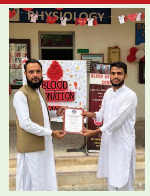
The blood donation camp was a resounding success, with a total of 140 pints of blood collected. Additionally, a donation of Rs20,400 was made in support of the cause.

Their presence highlighted the significance of the event and encouraged participants to actively contribute to this lifesaving initiative.